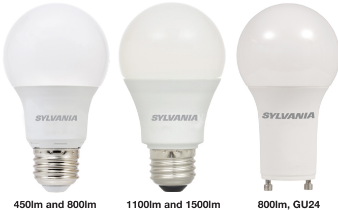
450lm and 800lm