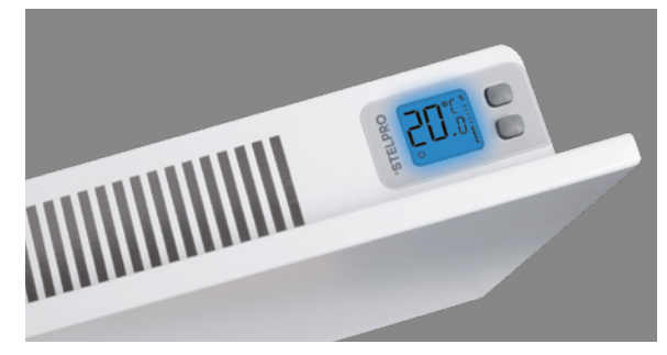
BUILT-IN ELECTRONIC THERMOSTAT AVAILABLE FOR THE 120 V TO 240 V MODELS

Electronic relays can receive a PWM (pulsed width modulation)