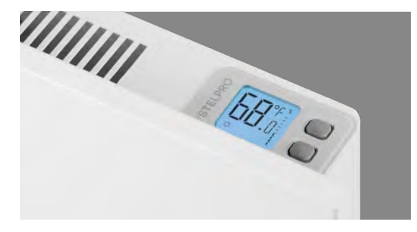
BUILT-IN ELECTRONIC THERMOSTAT AVAILABLE FOR THE 120 V TO 240 V MODELS

Electronic relays can receive a PWM (pulsed width modulation) or digital (on/off) signal. * Factory installed