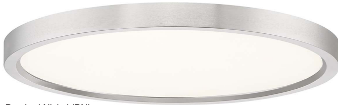
Brushed Nickel (BN)