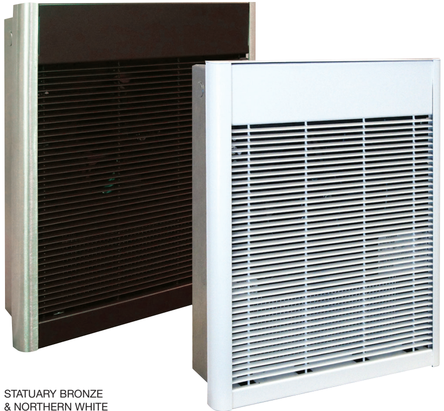
STATUARY BRONZE & NORTHERN WHITE