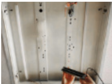
4. Install Snap & Go™ driver.