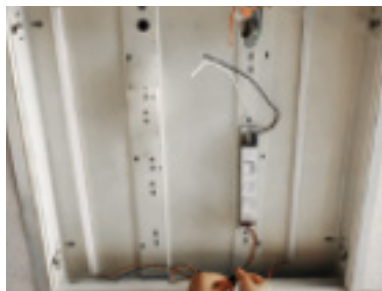
5. Connect driver's input line: Dim +, Dim - and module lines.