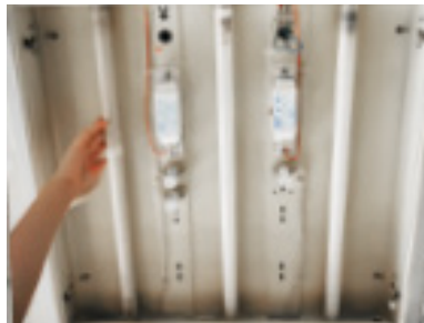
2. Disconnect wires and remove the original fluorescent tube(s) and ballast from the existing fixture. (Recycle tubes according to state specific recycling guidelines).