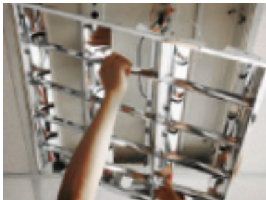
1. Remove the lens or louver (if required).

! WARNING DISCONNECT POWER BEFORE INSTALLING OR SERVICING.