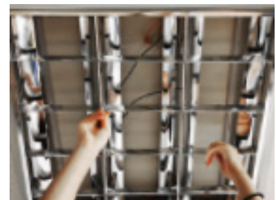
6. Replace lens or louver, if needed.