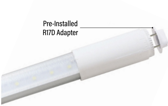
Pre-Installed R17D Adapter