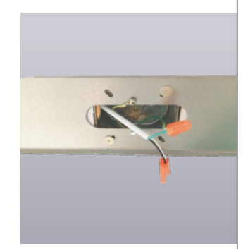
Step 3 Attach the bracket to junction box using the 2 screws (provided). Pull the AC cable with connector through the bracket center hole.