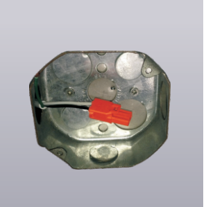
Step 1 Turn-off /disconnect power at circuit breaker. Attach connector (provided) to AC cable from junction box: