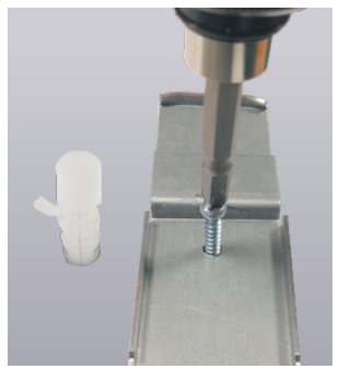
Step 2 Position bracket in place: Mark mounting hole positions on ceiling with reference on bracket. Drill holes, mount appropriate anchors, then secure screws into anchors.