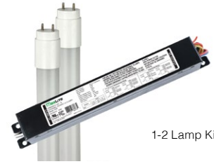
1-2 Lamp Kit