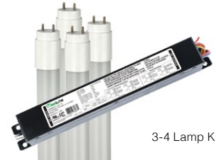
3-4 Lamp Kit