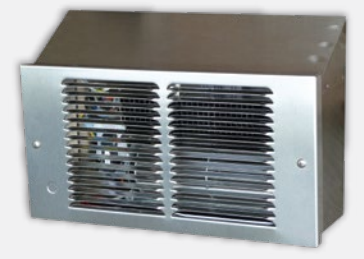
Intended for use on inspected vessels