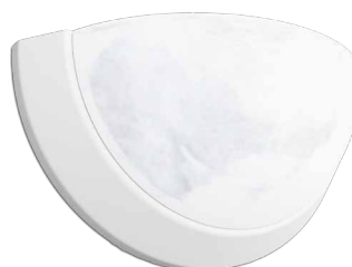
White Housing & Acid-Etched Glass Lens