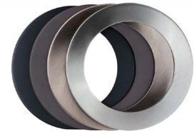
Field Installable Trim Kits: Black, Bronze, Copper & Brushed Nickel