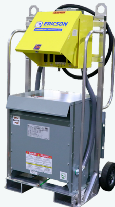
30-45kVA, 2-Wheel PTU