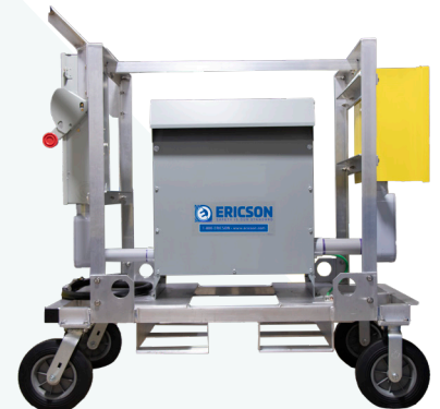
30-75kVA, 4-Wheel PTU