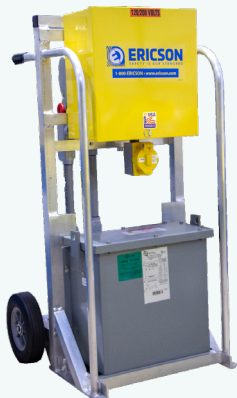
15kVA, 2-Wheel PTU