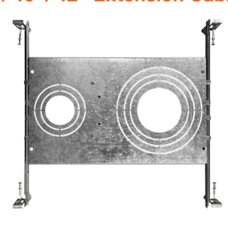
CUNV-NC-ICAT-7H Universal Pre-Mounting Plate 13 7/8" x 15 1/8"