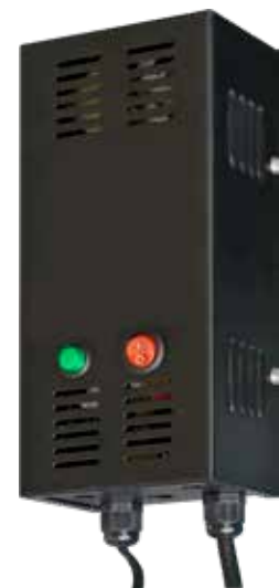
LVT25 Transformer (sold separately) Black or White