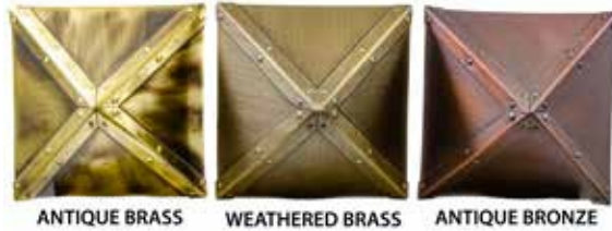
ANTIQUE BRASS WEATHERED BRASS ANTIQUE BRONZE