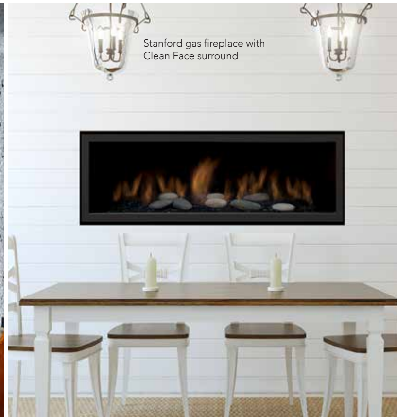
Stanford gas fireplace with Clean Face surround