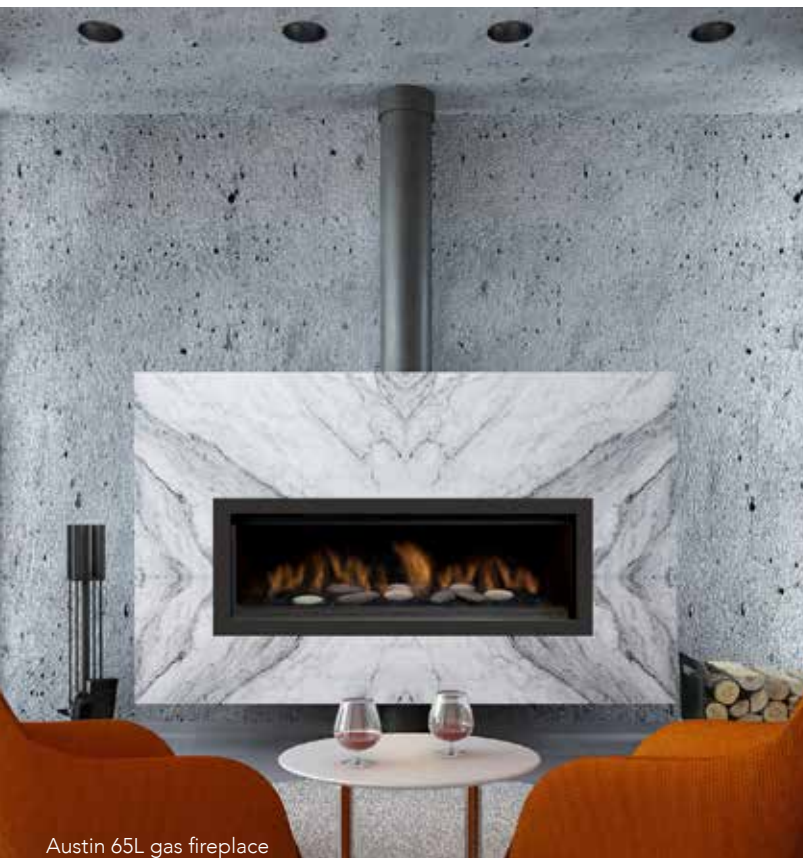
Austin 65L gas fireplace