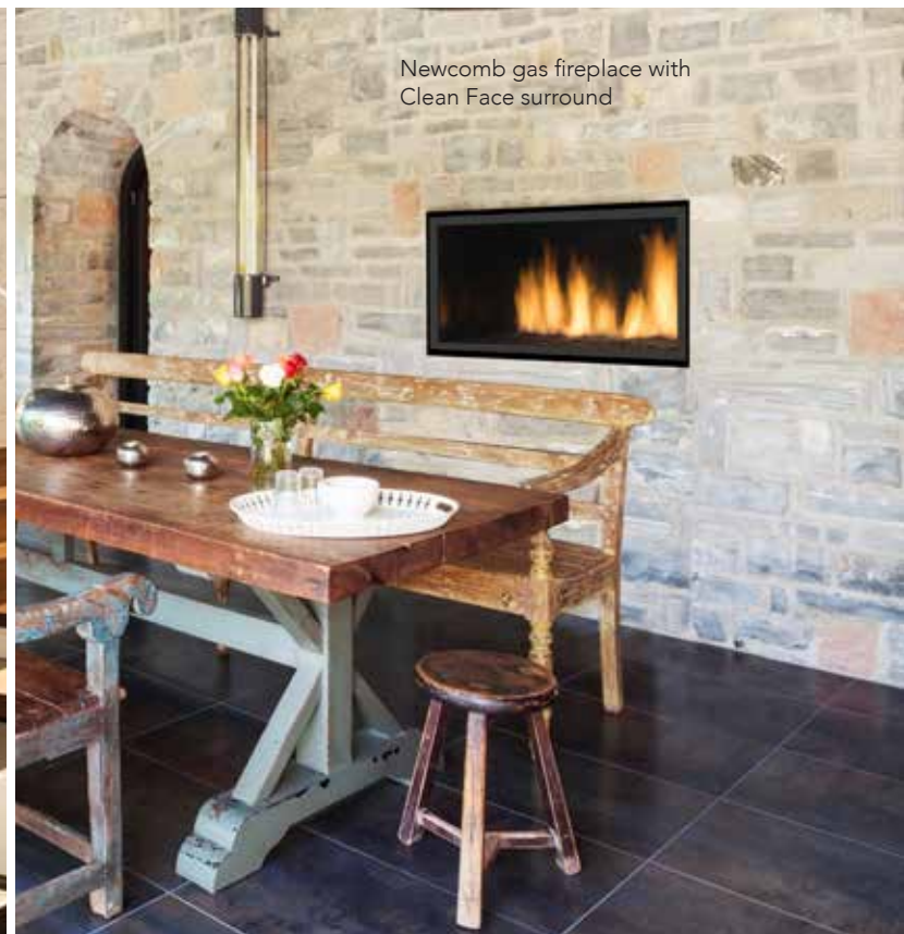
Newcomb gas fireplace with Clean Face surround