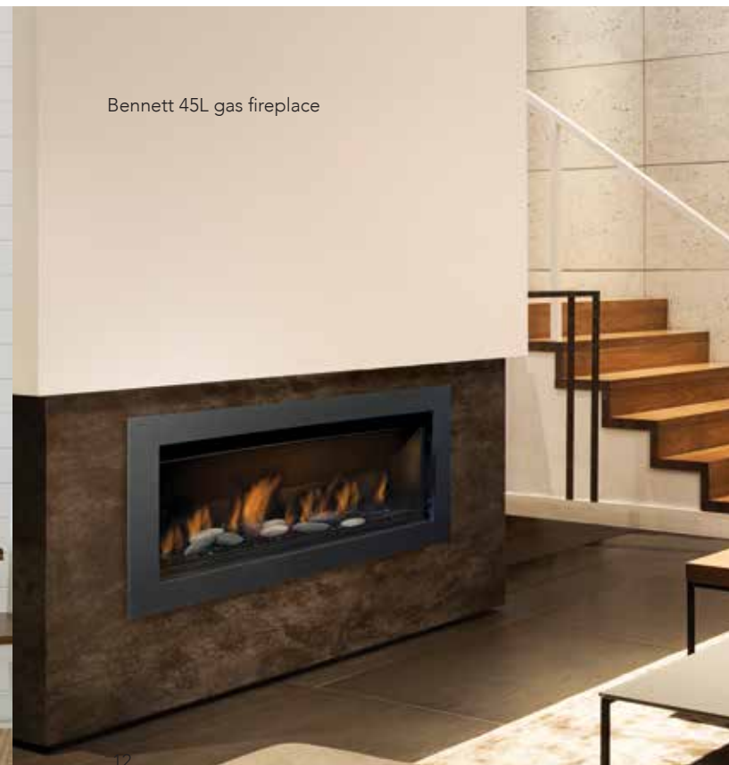
Bennett 45L gas fireplace