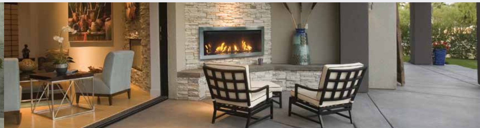
THE TAHOE 45OL

*For surrounds add between 5-20 lbs depending on the size of the unit.