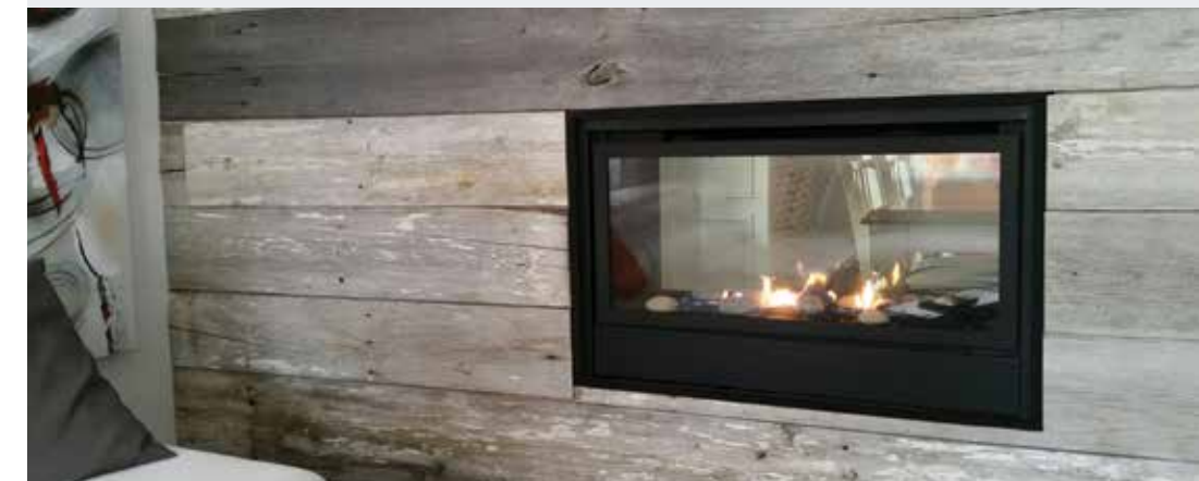
THE NEWCOMB 36DV

*For surrounds add between 5-20 lbs depending on the size of the unit.