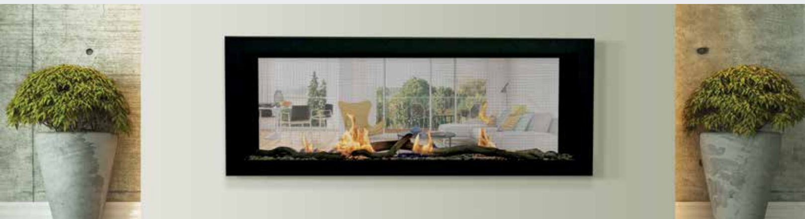
THE EMERSON 48ST

*For surrounds add between 5-20 lbs depending on the size of the unit.