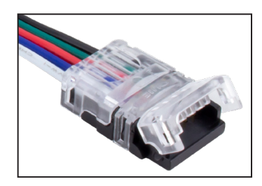
HD Power Feed (5-wire) TL-5PWR-HD