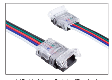
HD Linking Cable (5-wire) TL-5JUMP6-HD (6") TL-5JUMP24-HD (24")