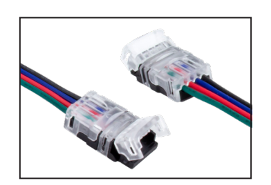
HD Linking Cable (4-Wire) TL-4JUMP6-HD (6") TL-4JUMP24-HD (24")