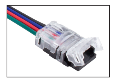
HD Power Feed (4-Wire) TL-4PWR-HD