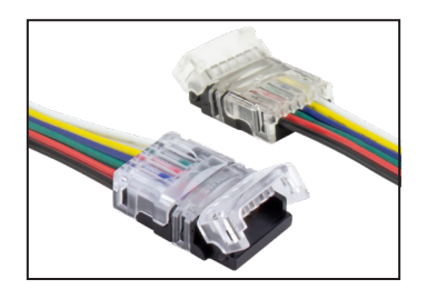
HD Linking Cable (6-wire) TL-6JUMP6-HD (6") TL-6JUMP24-HD (24")