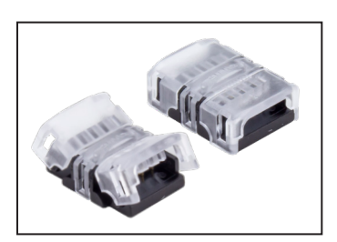
HD Splice (4-Wire) TL-4SPL-HD