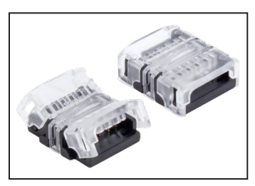
HD Splice (5-wire) TL-5SPL-HD