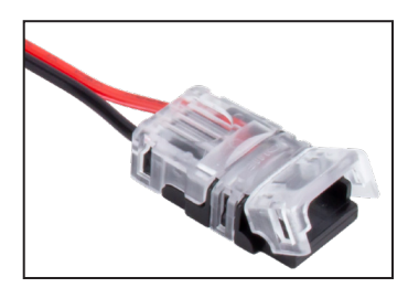
HD Power Feed (2-Wire) TL-2PWR-HD