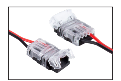
HD Linking Cable (2-Wire) TL-2JUMP6-HD (6") TL-2JUMP24-HD (24")