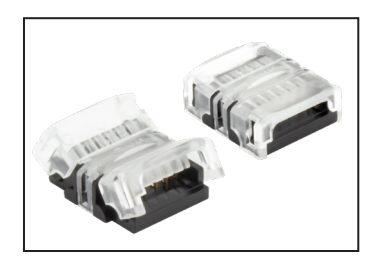
HD Splice (6-wire) TL-6SPL-HD