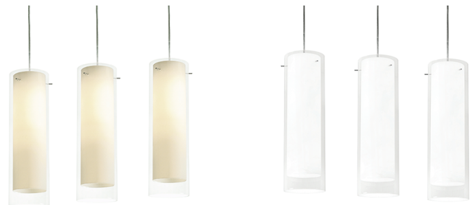
Clear Shade with Cream Glass