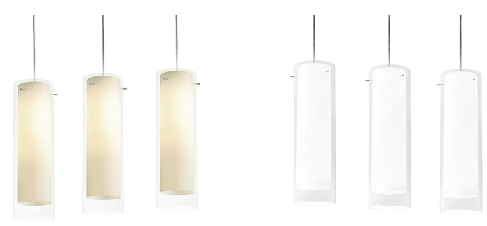
Clear Shade with Cream Glass